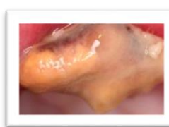
GRADE IV SEVERE tartar Tartar covers 80-100% of tooth