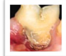
GRADE IV Severe Gingivitis >50% Bone Loss Severe Recession Loose Teeth