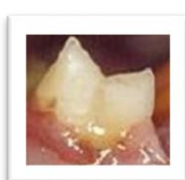
GRADE II Moderate Plaque Tartar covers <50% of tooth