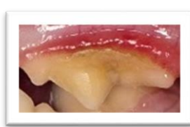
GRADE II Moderate Gingivitis <25% Bone Loss Swollen Gums Odor is Noticeable