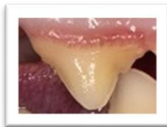
GRADE I Normal Mild plaque present No Tartar