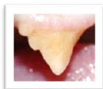
GRADE 0 Normal Some Plaque No Bone Loss