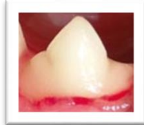
GRADE I Mild Gingivitis/Red Line No Bone Loss Reversible Changes