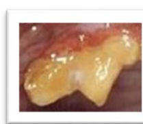
GRADE III Severe Gingivitis >25% Bone Loss Gingival Recession Sore Mouth