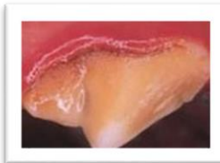
GRADE II Moderate Gingivitis <25% Bone Loss Swollen Gums Odor is Noticeable