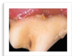
GRADE I Mild Gingivitis/Red Line No Bone Loss Reversible Changes