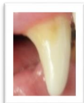
GRADE I Normal Mild plaque present No Tartar