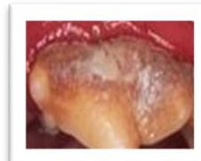
GRADE III Severe Gingivitis >25% Bone Loss Gingival Recession Sore Mouth