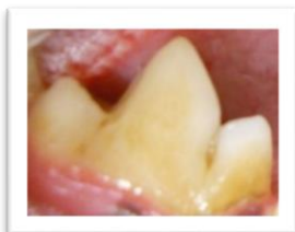
GRADE II Moderate Plaque Tartar covers <50% of tooth