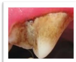
GRADE III Moderate Tartar Tartar covers 50-80% of tooth