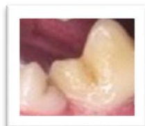
GRADE 0 Normal Some Plaque No Bone Loss