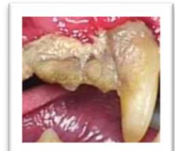
GRADE IV SEVERE tartar Tartar covers 80-100% of tooth