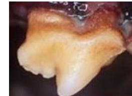
GRADE IV Severe gingivitis >50% bone loss Severe recession Loose teeth IRREVERSIBLE