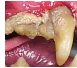
GRADE IV Severe tartar Tartar covers 80-100% of tooth