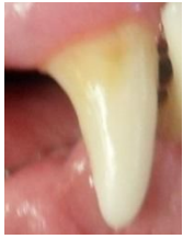
GRADE I Normal Mild plaque present No Tartar