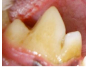
GRADE II Moderate plaque Tartar covers <50% of tooth