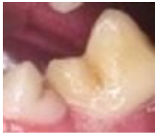
GRADE 0 Normal Some plaque No bone loss

*Cannot completely grade until animal is under sedation