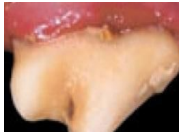
GRADE I Mild gingivitis/redline No bone loss Reversible changes