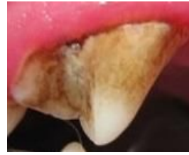
GRADE III Moderate tartar Tartar covers 50-80% of tooth