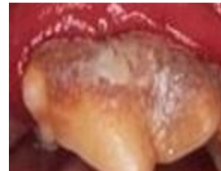
GRADE III Severe gingivitis >25% bone loss Gingival recession Sore mouth May be irreversible