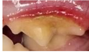
GRADE II Moderate gingivitis <25% bone loss Swollen gums Odor is noticeable