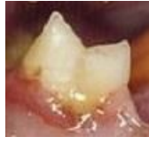
GRADE II Moderate plaque Tartar covers <50% of tooth