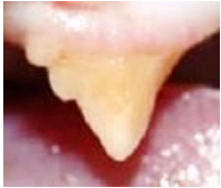
GRADE 0 Normal Some plaque No bone loss

* cannot completely grade until animal is sedated