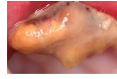
GRADE IV Severe tartar Tartar covers 80-100% of tooth