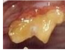
GRADE III Severe gingivitis >25% bone loss Gingival recession Sore mouth May be irreversible