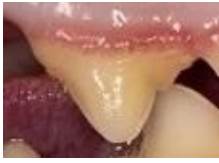
GRADE I Normal Mild plaque present No Tartar