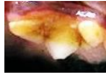
GRADE III Moderate tartar Tartar covers 50-80% of tooth