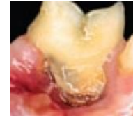
GRADE IV Severe gingivitis >50% bone loss Severe recession Loose teeth IRREVERSIBLE